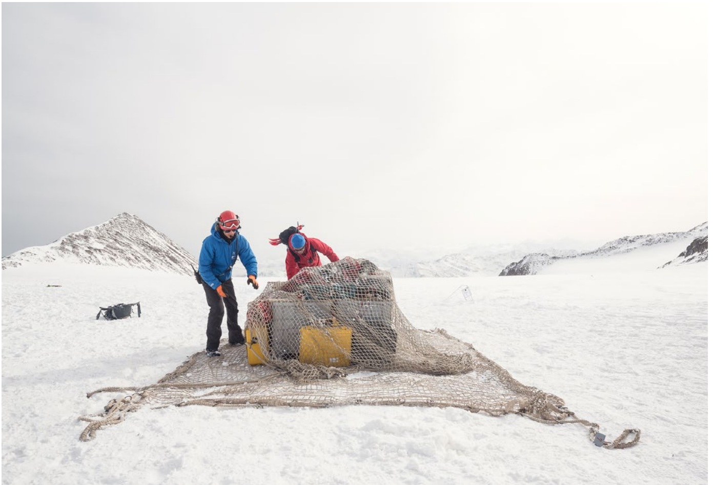
Installation on the Similaun glacier, April 2nd, 2016