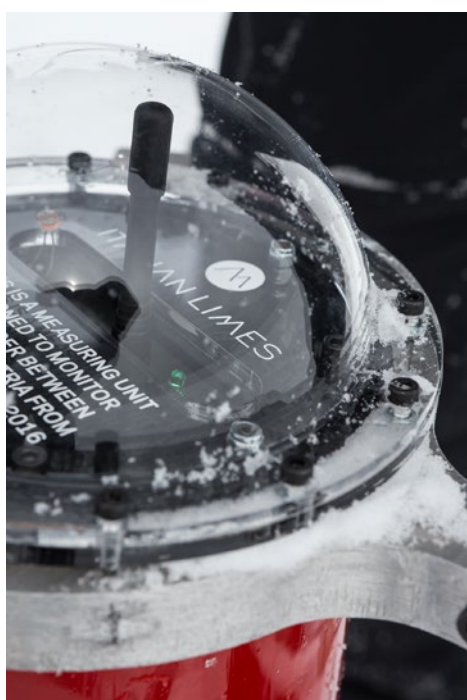
Detail of one of the 26 measurement units installed on the Similaun glacier on April 2nd, 2016

Since 2014, Italian Limes has aimed to monitor the shifts in the Austrian-Italian watershed on the Alps as an inquiry into the relation of borders and their representation . International borders have become one of the most reported topics on public media. In Europe, a network of apparently dormant 19th-century frontiers woke up from the dream of a borderless continent and materialised into a 21st-century psychosis of police checks, barbed wire fences, migrant encampments, proxy sovereignties and displaced jurisdictions. Almost completely exiled into the map, borders have claimed back their mark on the territory, wielded by governments as the ultimate defense for the continuance of the nation state.